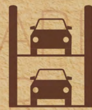
Multilevel Parking in 3 Basements

MULTILEVEL PARKING IN 3 BASEMENTS WELL-DESIGNED PARKING ELECTRIC CAR CHARGING STATION MOST MODERN SECURITY DON'T WORRY ABOUT PARKING IT'S TRULY FUTURISTIC WELL-DESIGNED PARKING CHARGING STATION MOST MODERN SECURITY MULTILEVEL PARKING IN 3 BASEMENTS