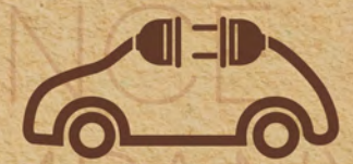
Electric Car Charging Station