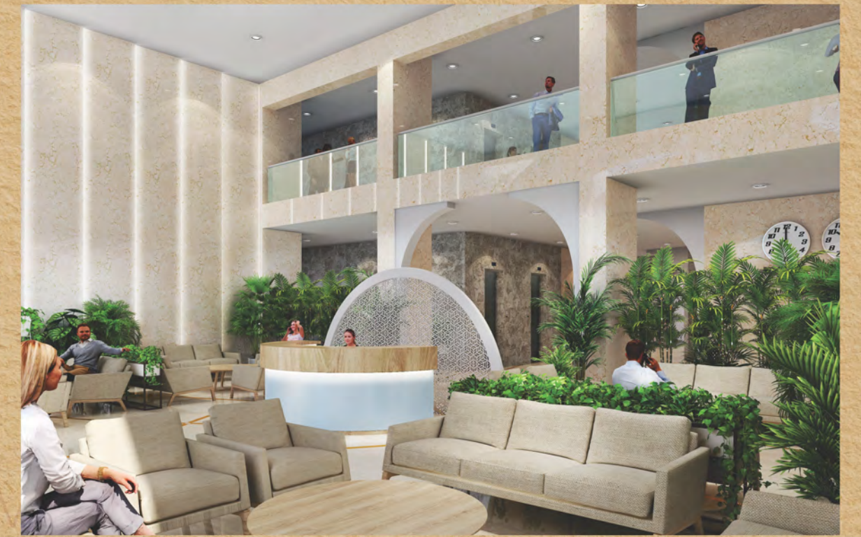
WAITING LOUNGE ON EACH FLOOR