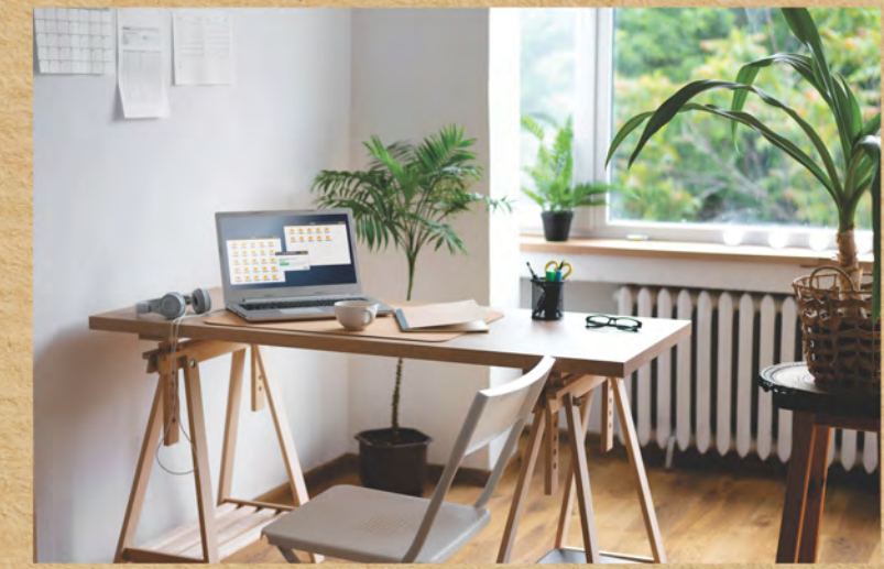
WORK DESK ON DEMAND