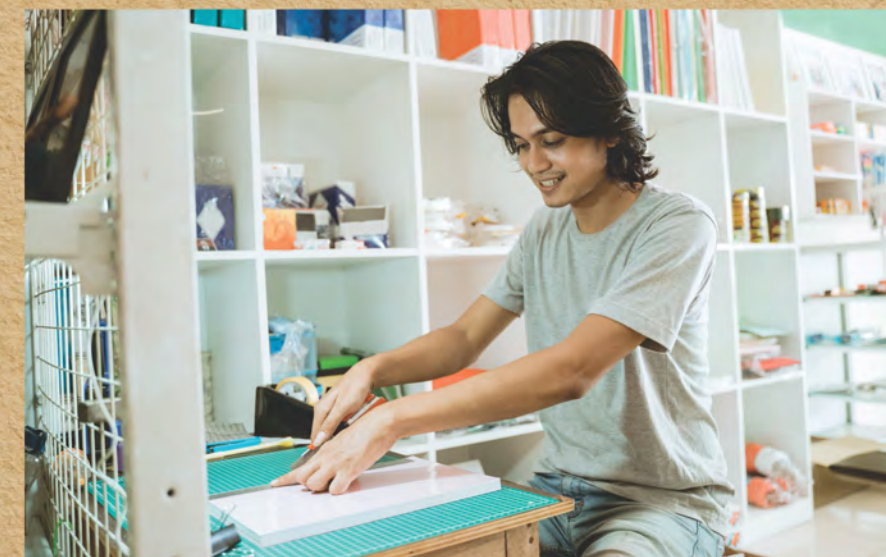
PRINTING & STATIONERY SHOP