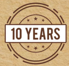
Maintenance Management by Company