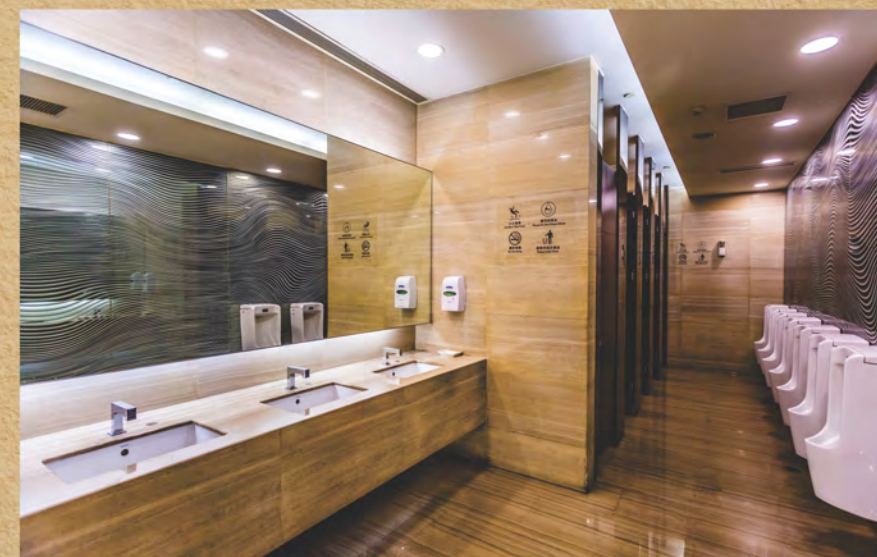
COMMON WASH ROOMS ON EACH FLOOR