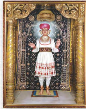
Bhagwan Sri Swaminarayan Shingar Darshan